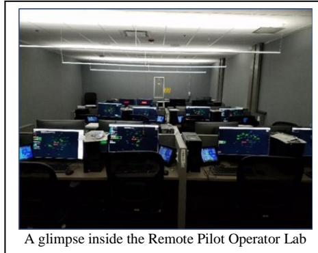
A glimpse inside the Remote Pilot Operator Lab

"The cooperation and collaboration demonstrated by the Academy's TETRA Team and the New-hire Direct Initial Screen (NDIS) Team represented by FAA Headquarters and National Air Traffic Controllers Association (NATCA) personnel was unprecedented. They designed, planned and