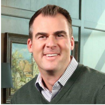
Governor Kevin Stitt