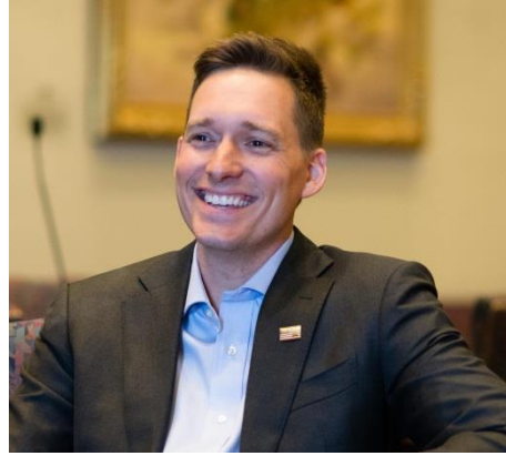
Lt. Governor Matt Pinnell

2300 N. Lincoln Blvd., Room 212 Oklahoma City, OK 73105 405-521-2342 www.governor.state.ok.us/