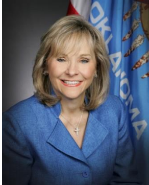
Governor Mary Fallin