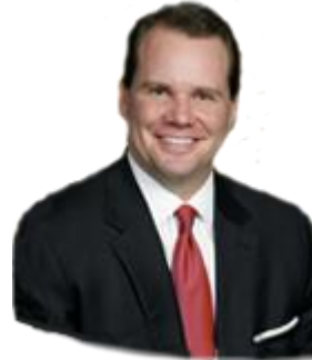
Lt. Governor Todd Lamb

2300 N. Lincoln Blvd., Room 212 Oklahoma City, OK 73105 405-521-2342 www.governor.state.ok.us/